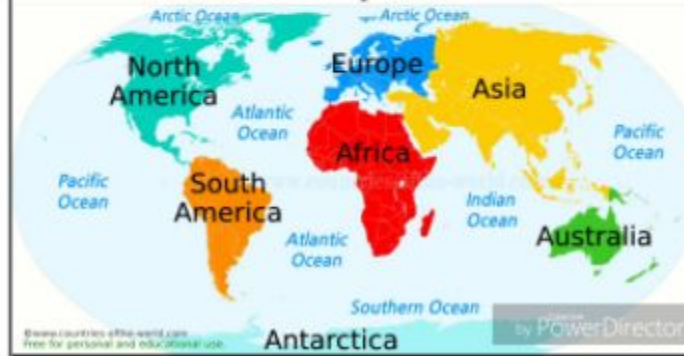
7 continents map with 5 oceans